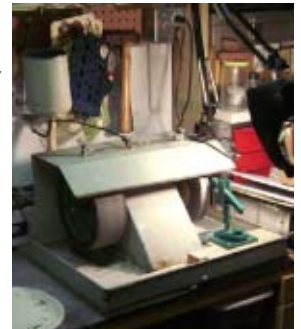
Lortone cabbing unit