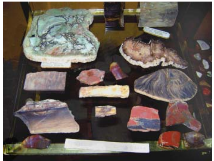
A wide variety of petrified wood

Willard has a stockpile of hundreds of pounds of lapidary rough and a large collection of mineral samples. The variety of lapidary rough is considerable. During a recent visit to Willard's shop by myself and club member Daniel Bontempo, I obtained a slab of opal-bearing rhyolite and a sample of milky quartz that I plan to cab or tumble.