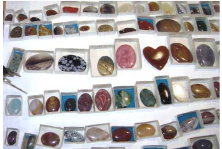
Some of the many cabochons in Willard's collection