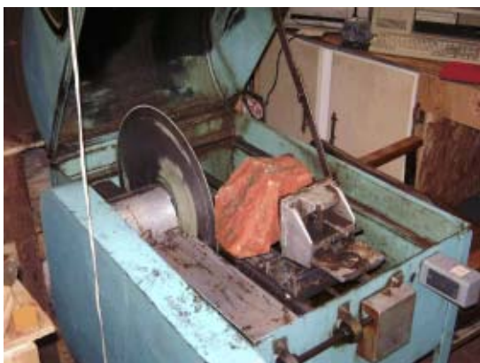
An 18" slab saw deals with the big rough.