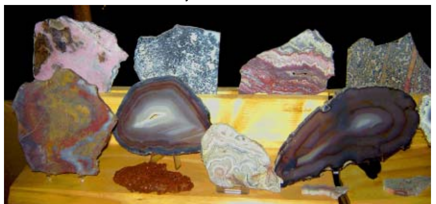
Willard's collection of slabs