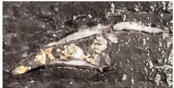
Figure 7 on page 13 of the magazine. Gastropod shell fragment in the Ludlowville Formation at 7,256.25 ft (about the size of the tip of a pinky nail).