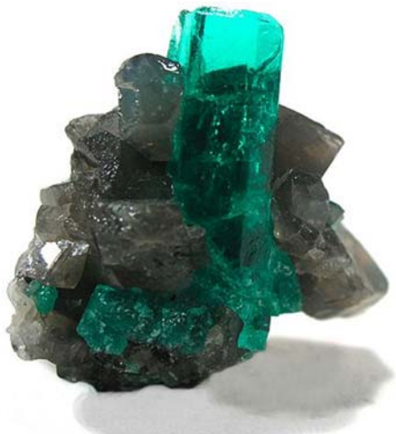
Emerald with Calcite. Concorcio Mine, Boyaca, Colombia. 1.7 x 1.5 x 0.9 cm.

We plan to publish additional issues as we receive more items from kids for Crack the News . Information about how kids and teens can send their newsletter contributions can be found at https://www.juniors.amfed.org/juniors-newsletter . Please encourage the kids in your club to help make this newsletter fun for junior rockhounds across the country.