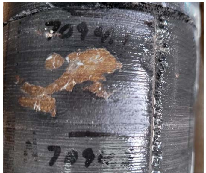
Figure 3 on page 11 of the magazine. Pyrite nodule in the Tully Limestone at 7,094.1–7094.2 ft.