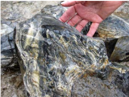
This banded chert nodule was found locally