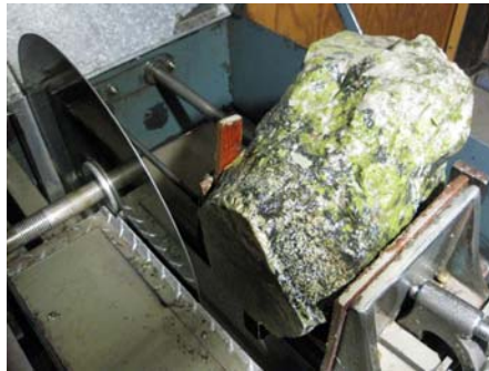
A large diamond saw cuts the rock to size