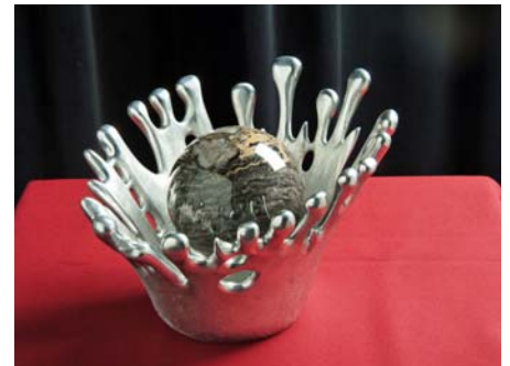
Pennsylvania banded chert in cast aluminum splash