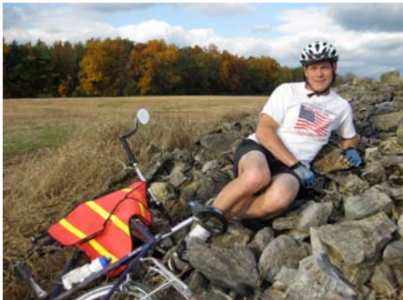
Bicycling affords roadside geology opportunities