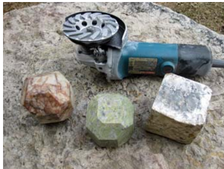
A diamond grinding wheel rounds edges