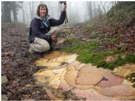
Hiking often uncovers remote collecting sites