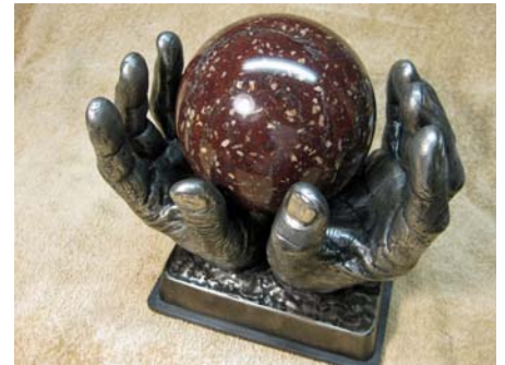
Pennsylvania metarhyolite in stainless steel hands