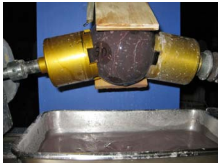
The wet grinding system forms the sphere